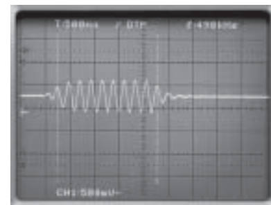
TV burst signal in delay mode with 2.Trigger